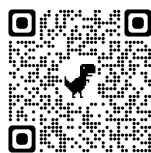
New to MOD11

The home team is responsible for ensuring Referees are added / have access to Modular11. Please see the tutorials of ACCESS for new referees to MOD11 as seen in video here as well as experienced Referees in MOD11 as seen in video here .