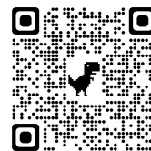
Horizontal Mobile Device

Match Reporting: Please submit the Match Report immediately following the Match or at very least on same day as Match has played as seen in video here .