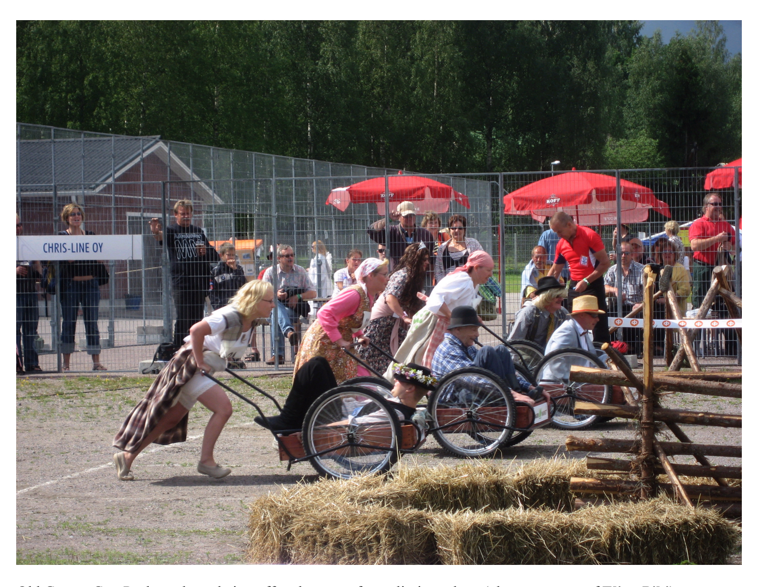
Old Geezer Cart Pushers show their stuff at the start of a preliminary heat