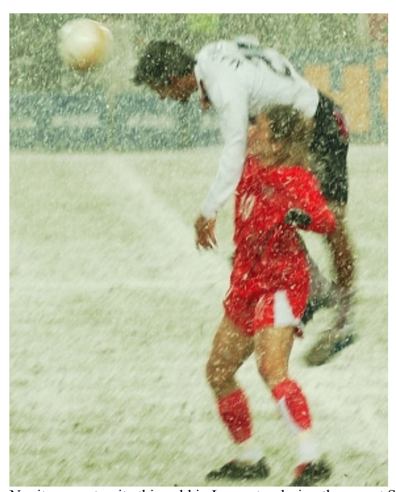
No, it was not quite this cold in Lancaster during the recent State Cup matches (news photo)