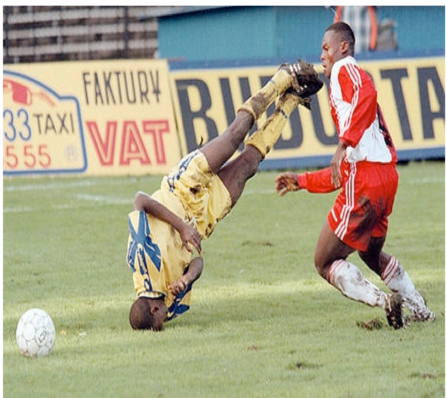
You don't see this every day (recent news photo)