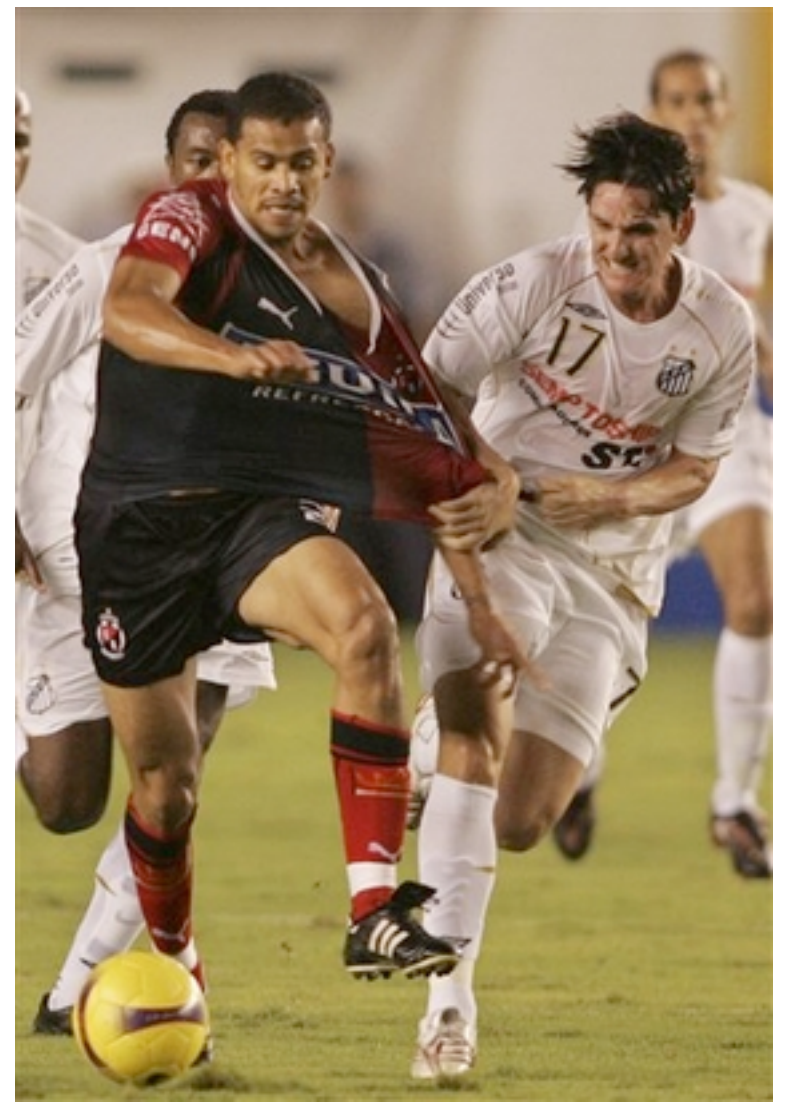
This is what you would have seen if you had watched a recent Columbia-Brazil match (news photo)

What do you get when you cross a referee with The Godfather? A call you can't understand.