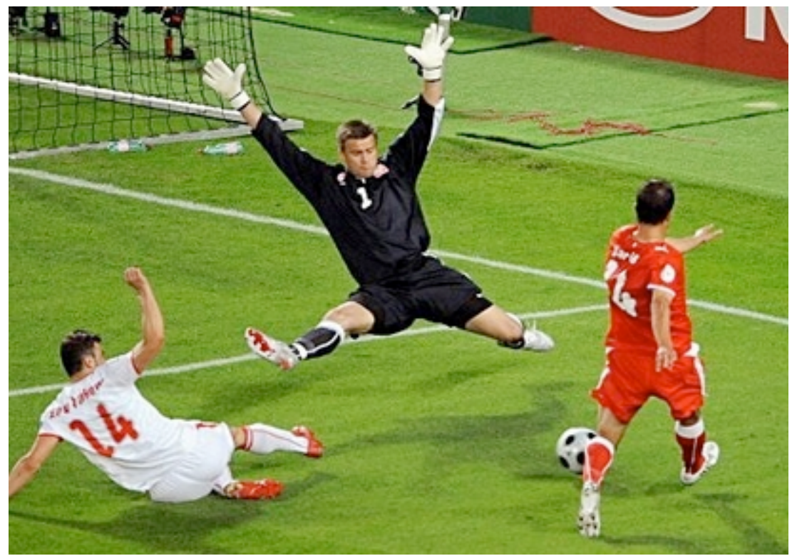
Euro 2008 action, Poland versus Austria (news photo)