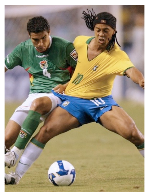
No shirt grab here against Ronaldhino