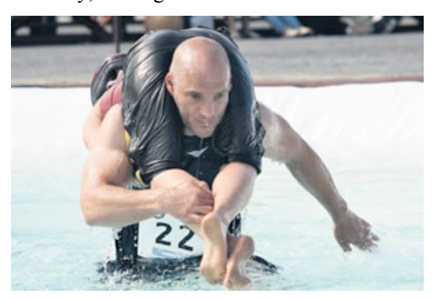
The Finnish summer is full of odd sports, but few can rival the international popularity of wife carrying. This German couple made it to second place in this year's World Championships.

Despite being a nation with a population of only slightly over five million, the Finns are most inventive when it comes to weird and wacky world championships. From early July until the end of August, almost every week sees a world championship competition in a sport that the Finns can call their own.