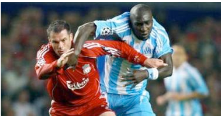
Boys will be boys (recent Champion's League action)

THE NEXT MEETING IS ON TUESDAY, NOVEMBER 25, 2008 AT 7:30 P.M. IN THE LIBRARY OF NORTH TORRANCE HIGH SCHOOL, 3620 182<sup>ND</sup> ST. (AT YUKON - SEE SSBRA.ORG FOR DETAILED MAPS), WHEREIN BEVERAGES AND FOOD ARE PROHIBITED BY THE SCHOOL. THIS WILL BE THE LAST MEETING OF 2008, AS THERE IS NO MEETING IN DECEMBER. THE AGENDA WILL INCLUDE ASSOCIATION BUSINESS AND STUFF.