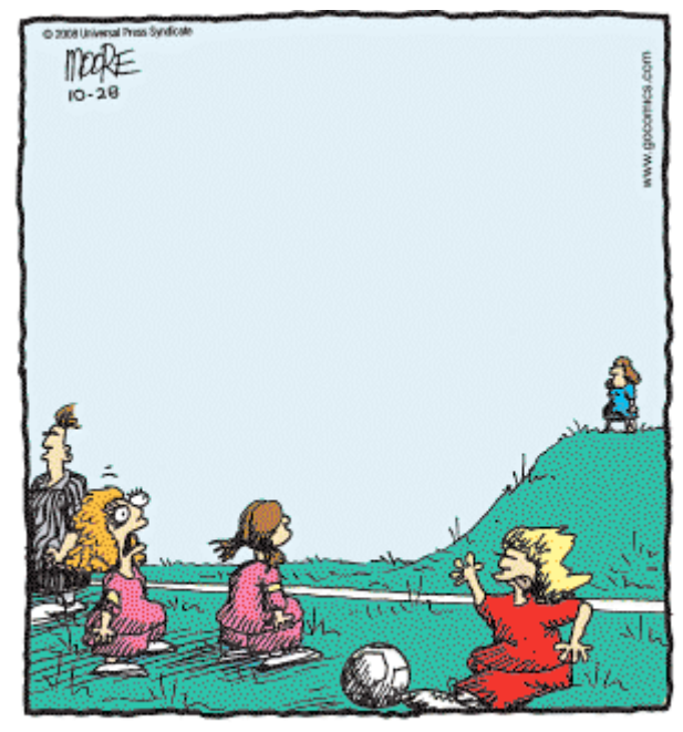
"That's my mom. The restraining order won't let her get within shouting distance of the ref."

A report was made to the (local) Police Department, and a policeman came to the field later. He said that she could either get punished within the league system without filing a charge, or get arrested for a misdemeanor (battery). At that point, I decided not to file a charge against her. But, I might change my mind if I think she didn't learn a lesson from this. The only reason I gave her (another) chance is that she is a mother of kids and has never done that kind of thing before, based on what I heard from my fellow referees who have known her. She made a big mistake and I hope she learns something from this (editor's note: a police report was later filed, and the player, with the assistance of SSBRA, has been banned from all leagues in our area, a punishment that she acknowledged and accepted in her written apology letter).