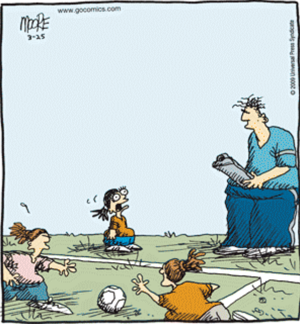
"Gosh, you seem to know a lot about soccer. I like that in a coach."