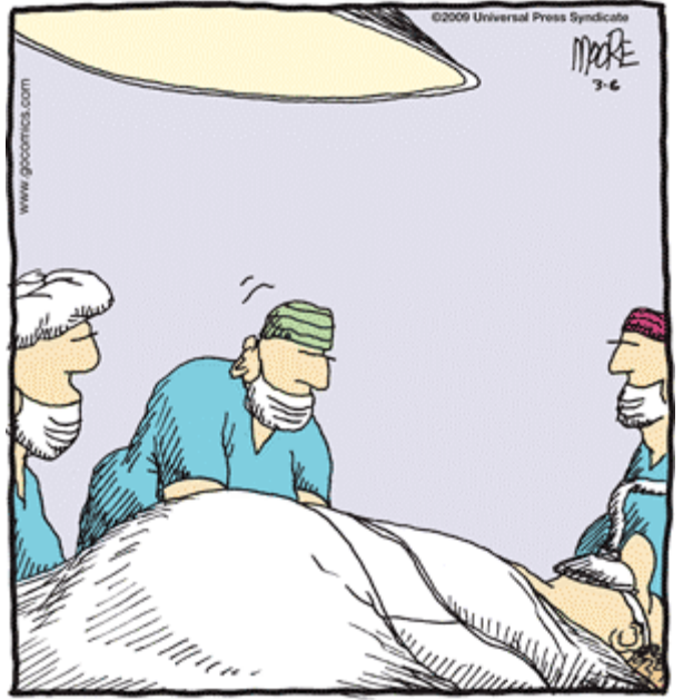
"Found it ... Good heavens! It's the size of a soccer ball! Oh, wait ... It is a soccer ball."