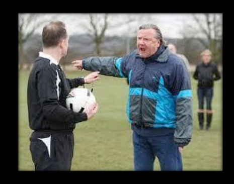
What I really do