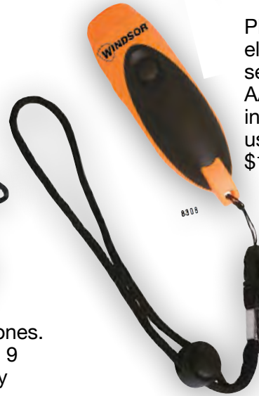
PR21 Windsor electronic. 3 selectable tones. 2 AAA batteries included. All climate use. $18.00