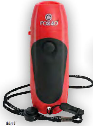
PR22 FOX 3 selectable tones. Electronic. 125dB sound. 9 volt battery included. Very effective. Sanitary. $19.00