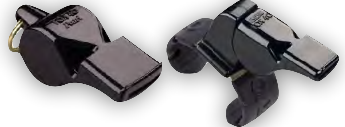
PR17 FOX40 CLASSIC. $5.00