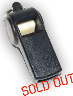
PR20 DEVASTATOR. This incredible Danish turbo whistle (in limited supply) Is one of a kind. Most who try it won't use anything else. $9.00