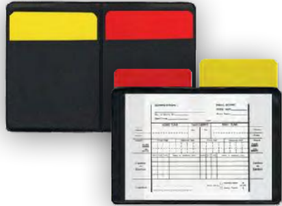
PR26 Vinyl data wallet with cards and pad. $4.00