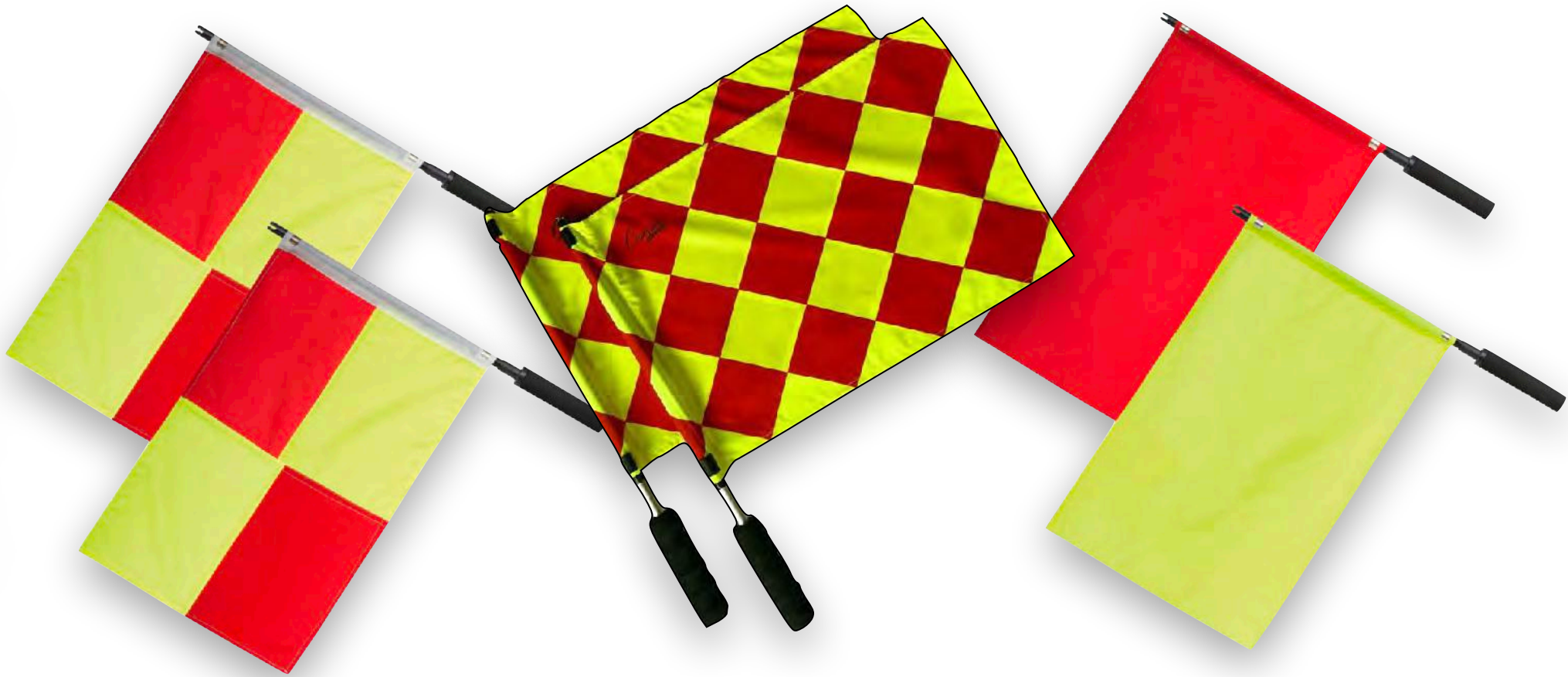
Top left: PR11 foursquare checked flag. Rotating mechanism, foam grip handles, Carrying case. $12.00