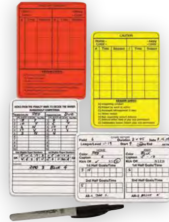
PR25 WRITE-ON card set. Laminated, waterproof cards include: yellow, red and white data recording cards. 2 sided white card records KFTM deciding tied games. Best to use retractable ultra fine point Sharpie. Remove ink using nail polish remover, or alcohol swabs. $7.00 (Sharpie not included)