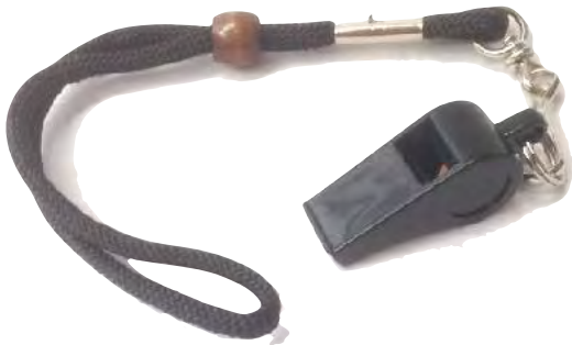
PR15 Windsor plastic whistle. $1.00