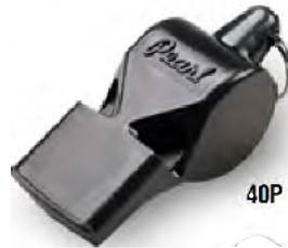
PR19 FOX PEARL Smaller whistle with intense sound. $4.00 (great value)